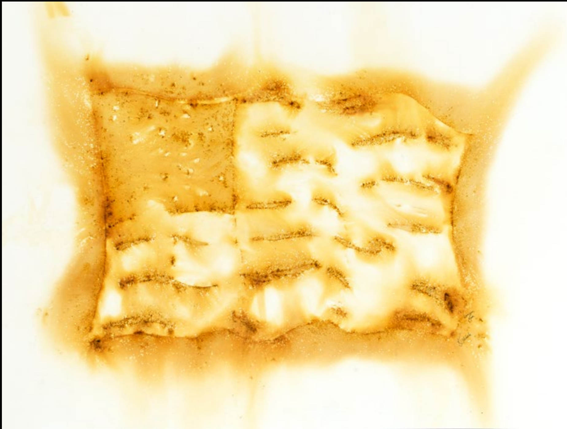
Connor's Flag, 18"x24" Ignited Gunpowder on paper