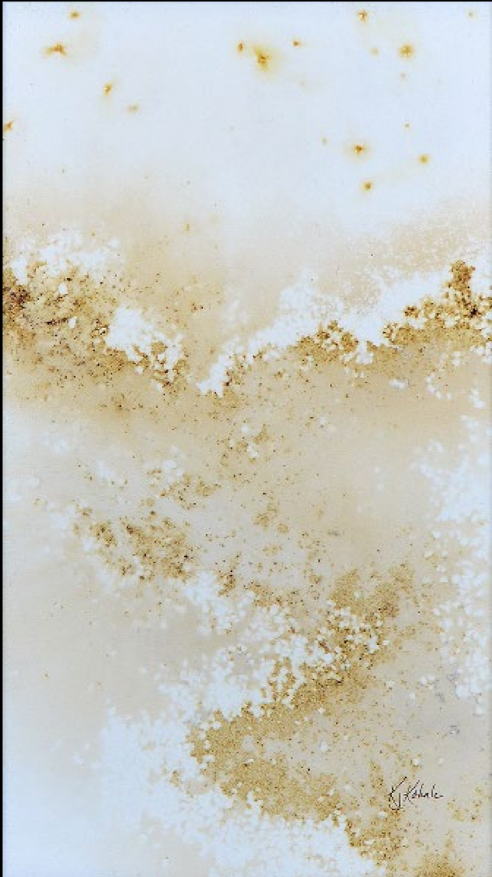
The Journey , 7x16, $220, Ignited Gunpowder on paper