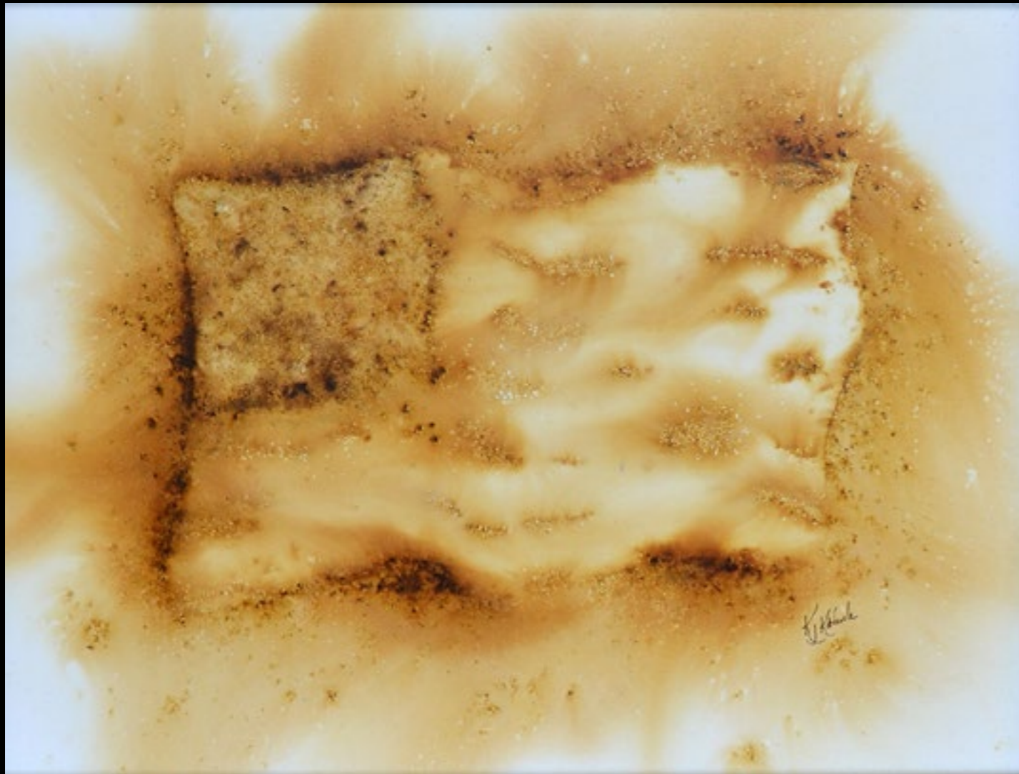
Unmistakable , 16x12, $350 Ignited Gunpowder on paper