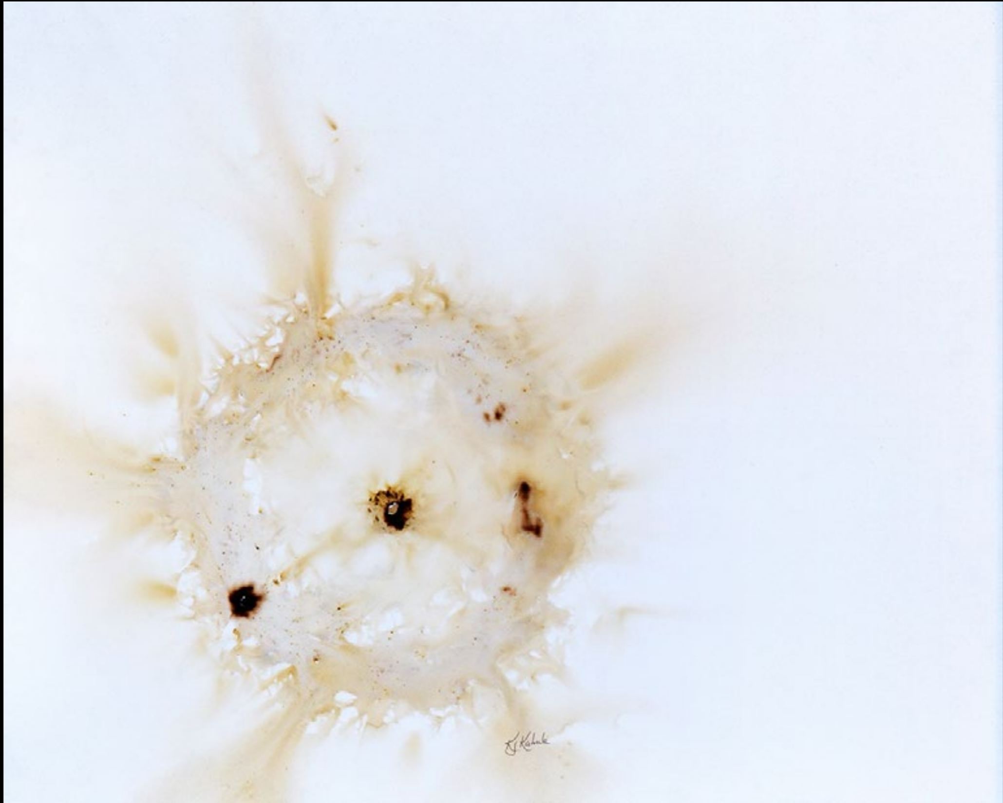
Cosmic Chaos , 23x27, $490 Ignited Gunpowder on paper