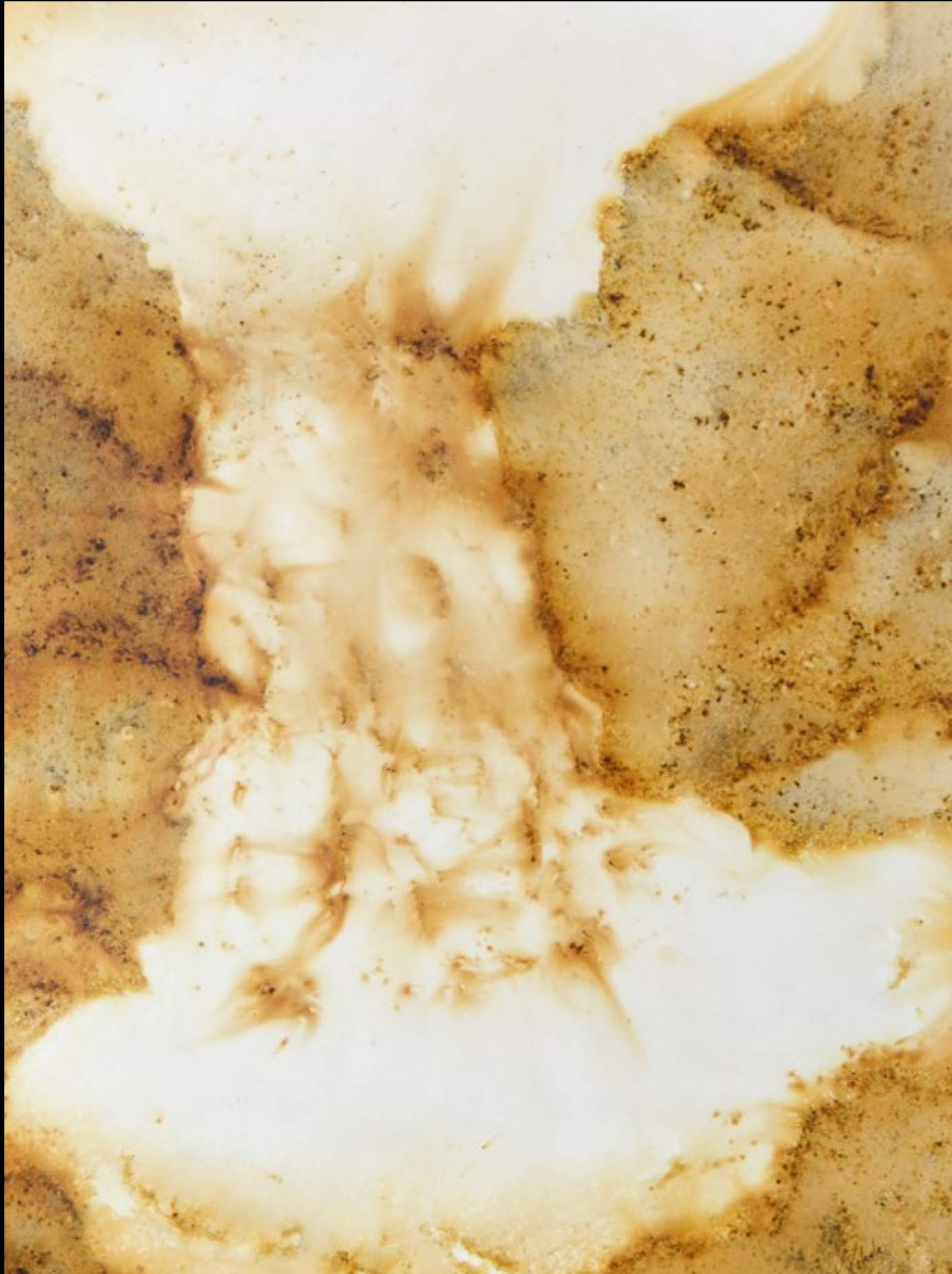
Quiet Power , 18x24, $490 Ignited Gunpowder on paper