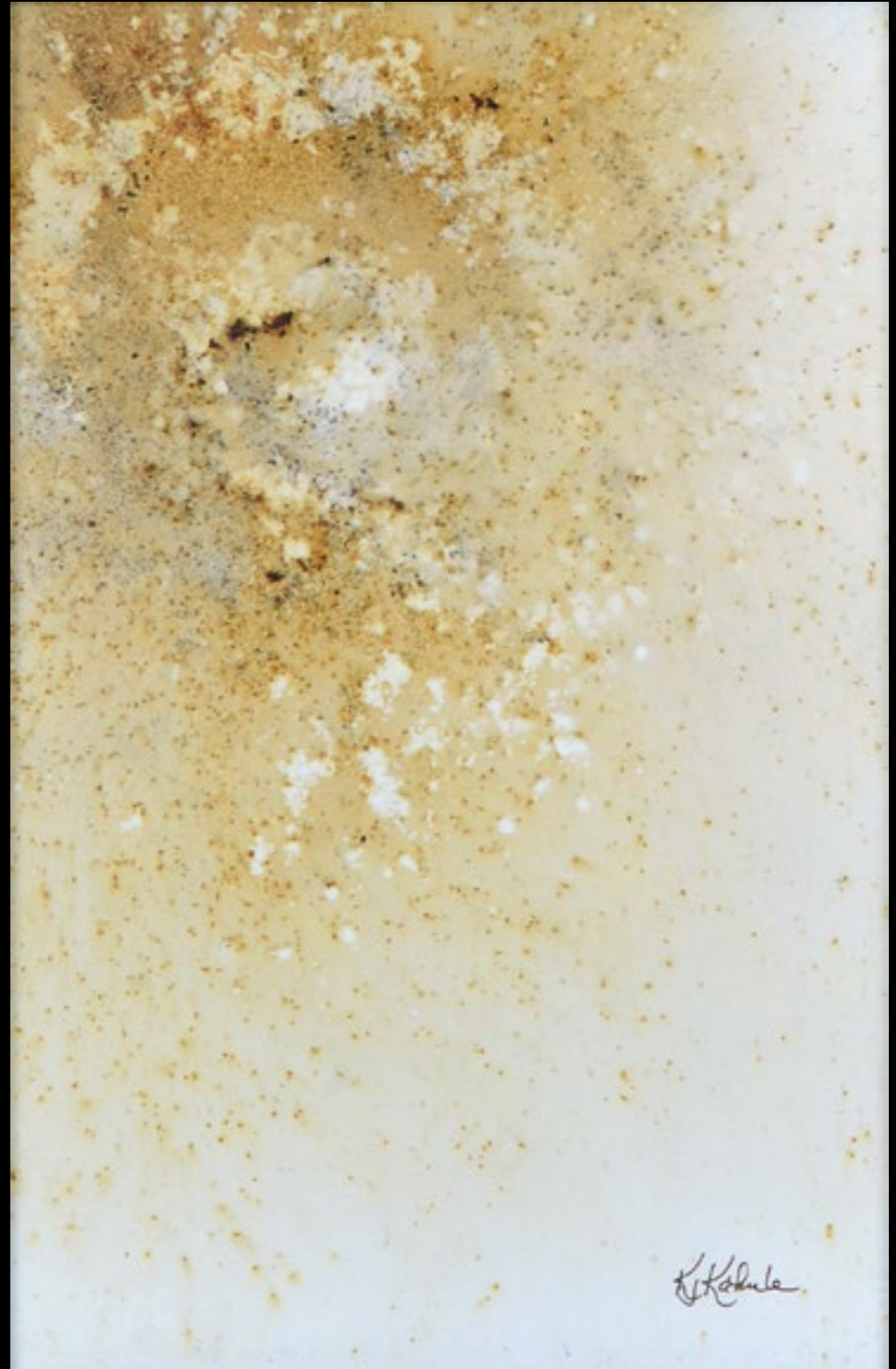
Vortex , 8x12, $220 Ignited Gunpowder on paper