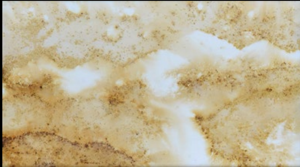
The Hike , 9x14, $220 Ignited Gunpowder on paper