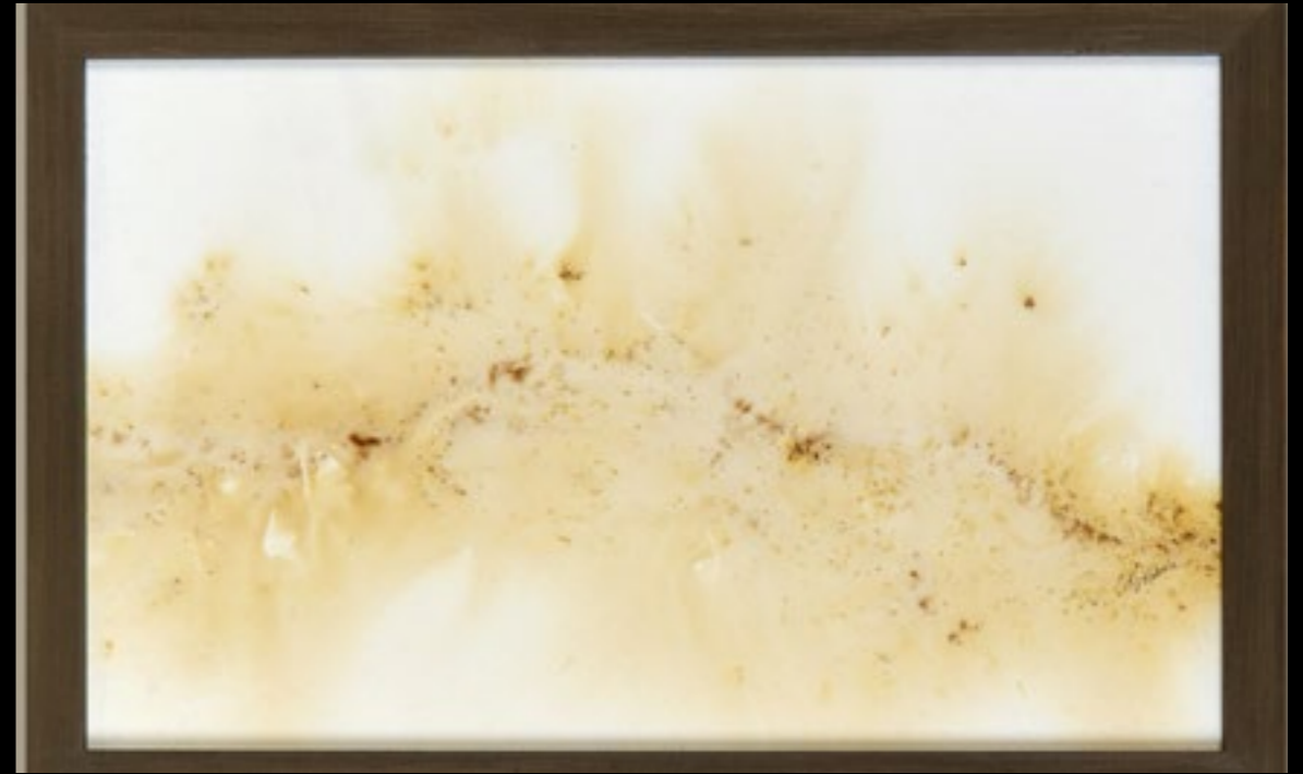
Dreaming , 9x17, $220, Ignited Gunpowder on paper