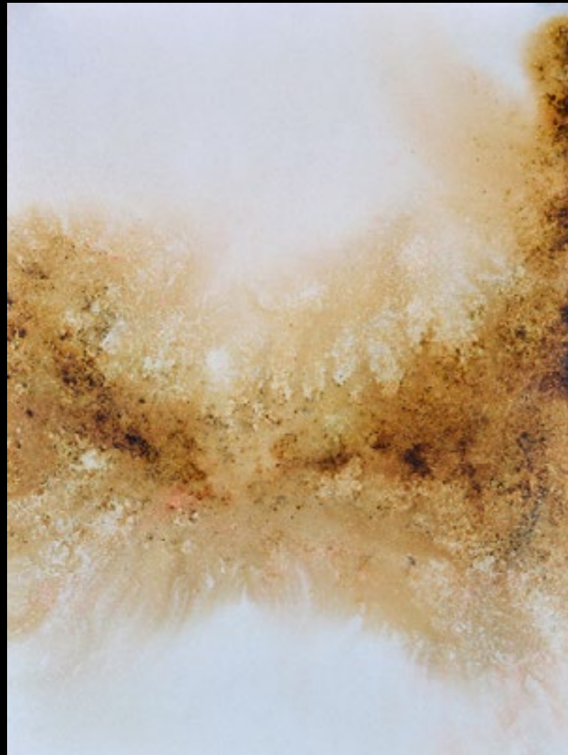
Reflections , 18"x24", $450 Ignited Gunpowder on paper

"Reflections" was created from 10-12 individual burns.