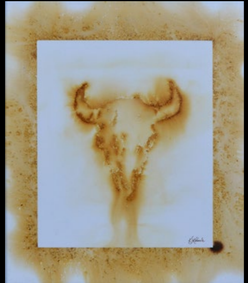
The Story Teller , 11"x14" $350 Ignited Gunpowder on paper