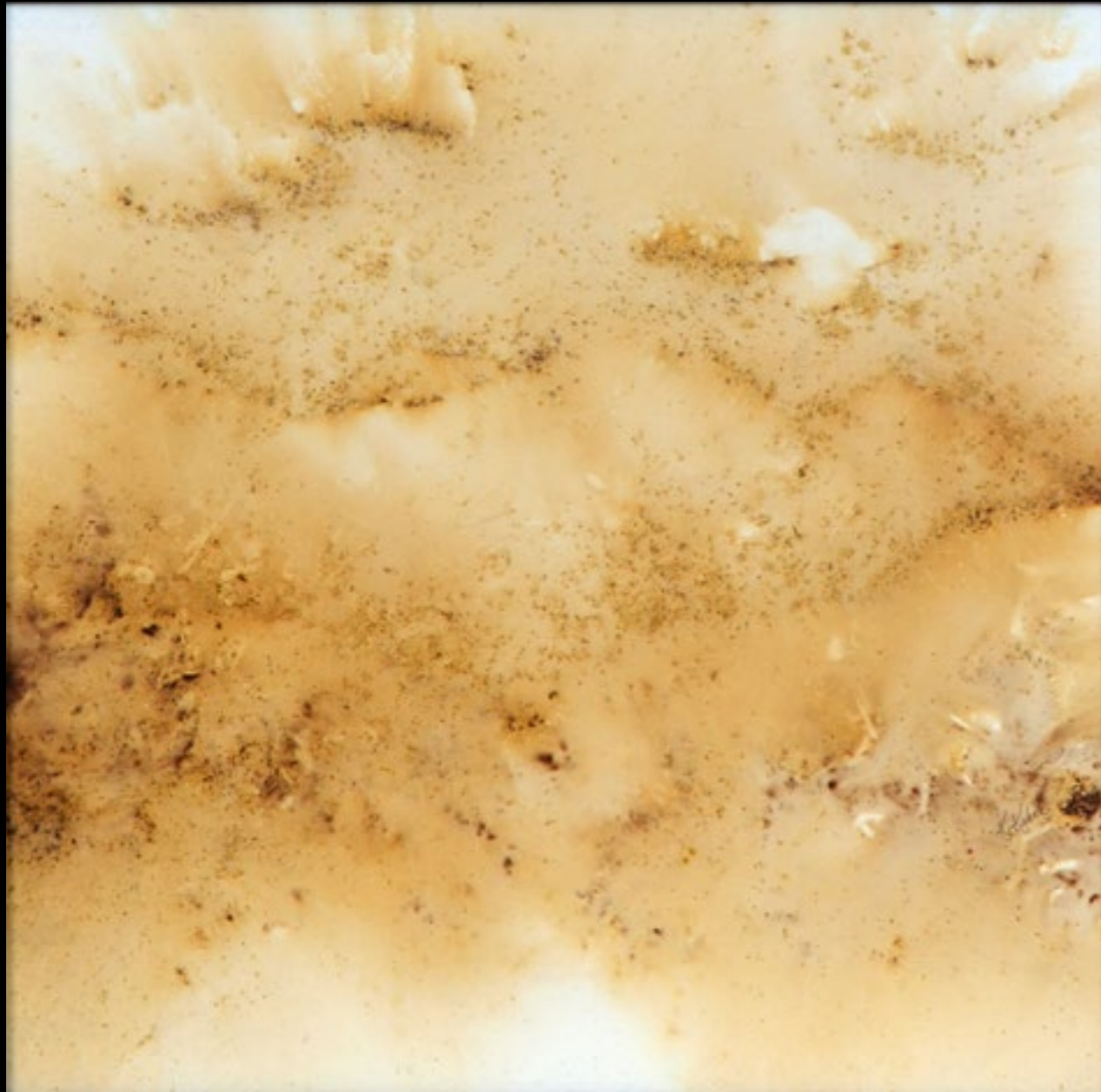
Burned Evening , 14x14, $250 Ignited Gunpowder on paper