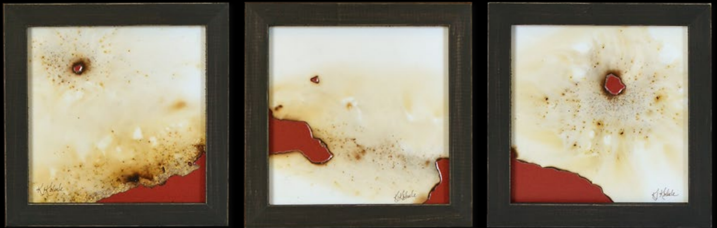
From Here Out , each 7"x7", $400 (tryptic) Ignited Gunpowder & canon fuse on paper