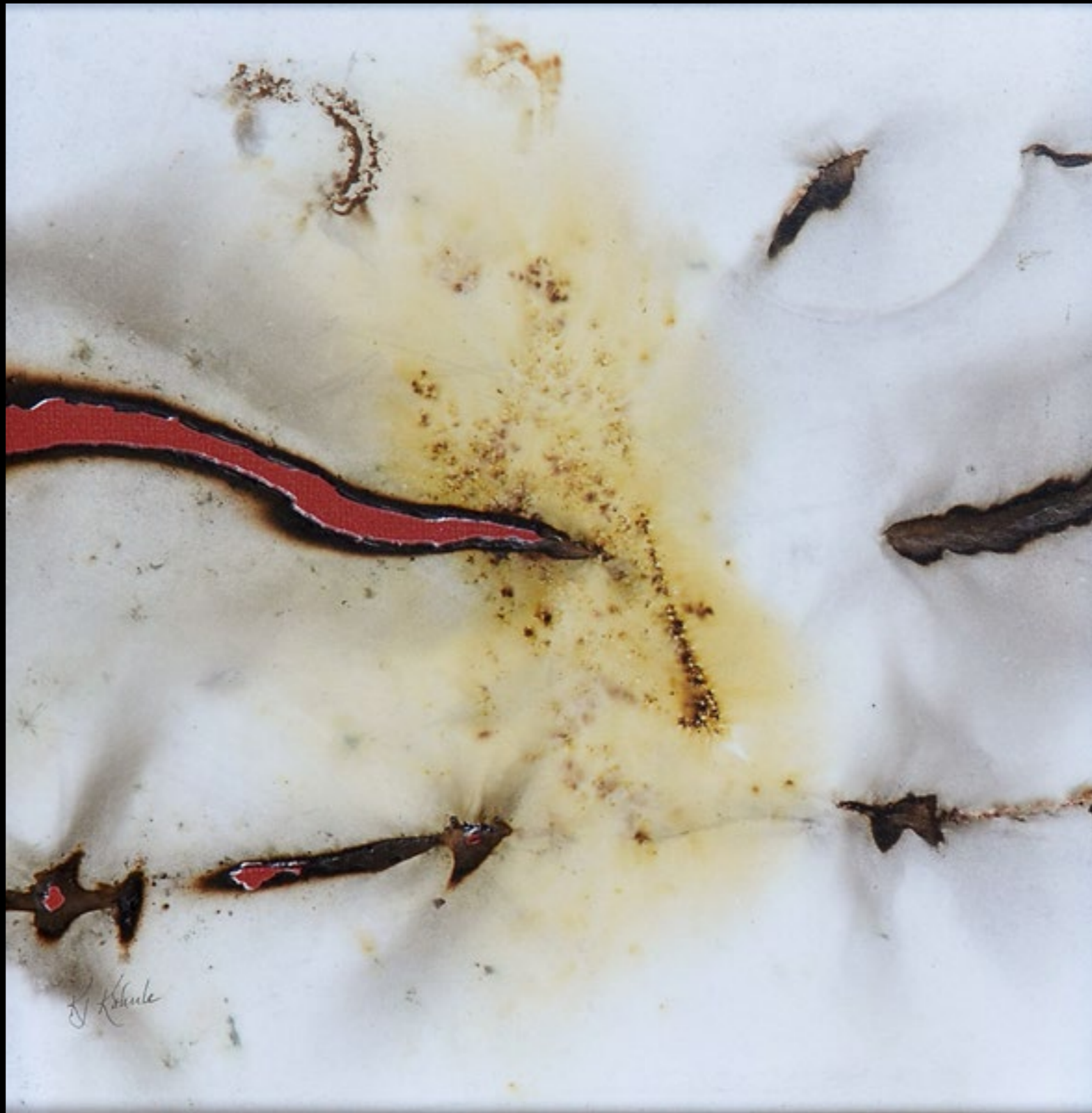
Wired , 14"x14", $300 Ignited Gunpowder & cannon fuse on paper